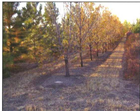
When fabric is not used, weed control can be handled by tillage (hand hoeing or rotary tree cultivation), mulch, or herbicides. Glyphosate works well when trees are larger and not as sensitive to herbicide drift.