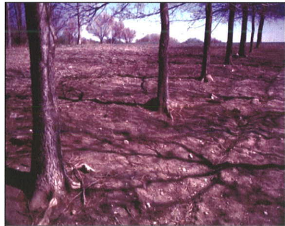
Tree roots can be damaged by tillage and erosion.