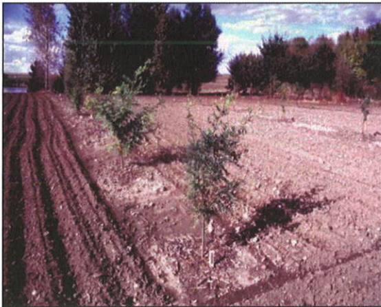
Frequent tillage may cause soil erosion.

Fabric Mulch Plantings: Seeding warm-season grass between the fabric strips soon after tree planting is desirable to prevent weed competition, especially from invasive species such as Canada thistle and wormwood. Tillage is also an option, but care must be taken to prevent pulling up the edges of the fabric.